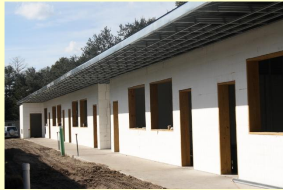
Well under way!