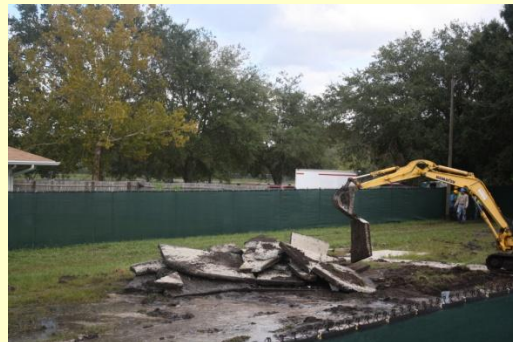
The First ground is broken!