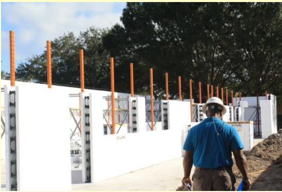
ICF Construction - Insulated Concrete Foam Block