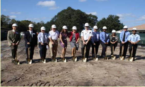
Ground Breaking Ceremony 11-1-11